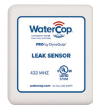
Low Profile Wireless Flood Sensors fully supervised and addressable