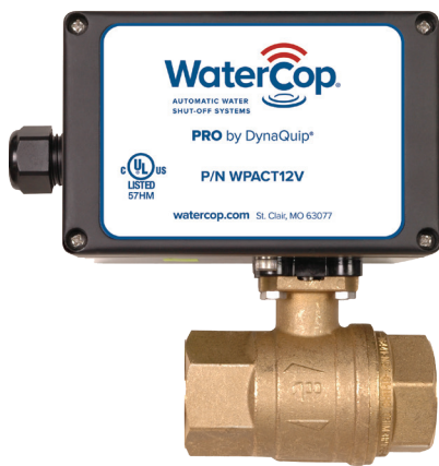
Outdoor Shut-Off Valve hardwired to indoor Water Control Panel

WaterCop® Pro provides the most complete plumbing leak protection while offering the most flexible installation options and third party monitoring/security integration.