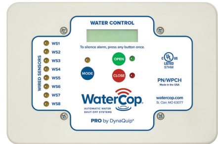
Indoor Water Control Panel