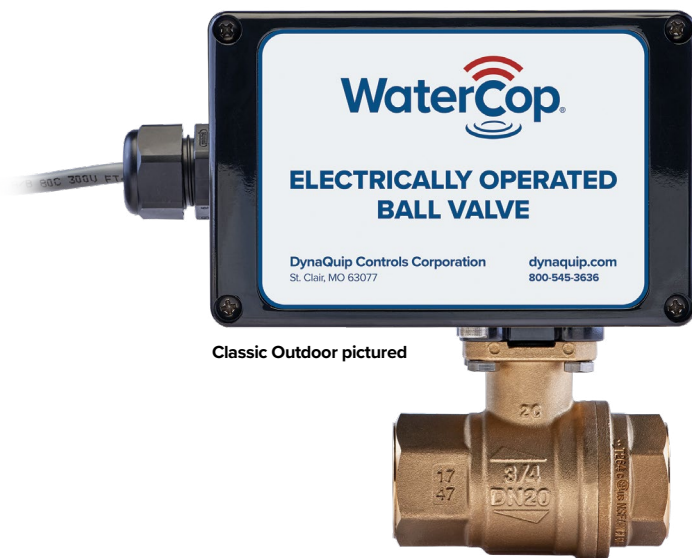
Classic Outdoor pictured

Installed within the home. Receives wireless signals from Classic components and notifies Outdoor Control Valve through hardwired cable.