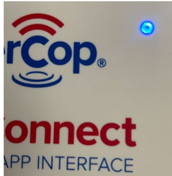
BLUE LED (above)