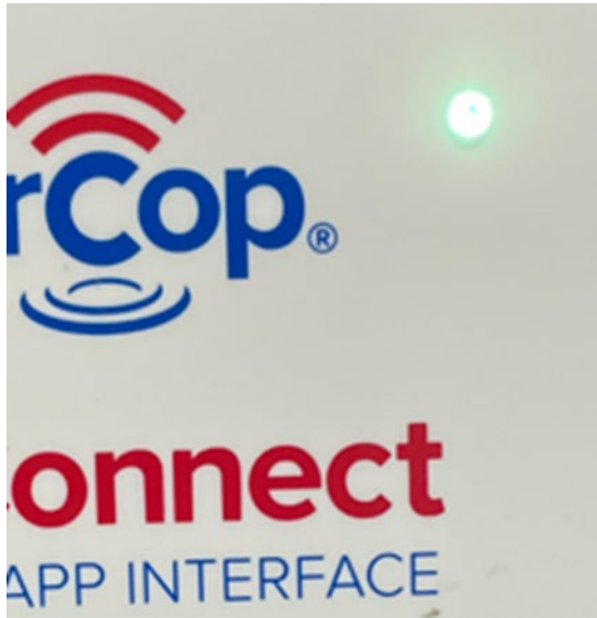
WHITE LED (above)

Below are some helpful images to help differentiate between the different LED colors as they happen during setup. The white does appear light blue or greenish to some initially.